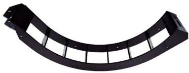
KX7 Empty Frame