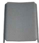
KX7 MaxBlock Box Insert

Contact Your Dealer to Order | Questions for Kondex? Contact Us: KX7@kondex.com or 800.447.1860