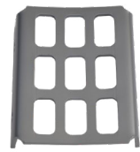
KX7 MaxGrate Box Insert