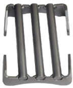
KX7 MaxRound Box Insert