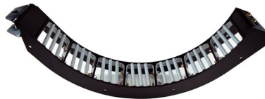
KX7 MaxRound Extreme Wear Concave Assembly