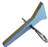
KX7 Wedge Lock

Contact Your Dealer to Order | Questions for Kondex? Contact Us: KX7@kondex.com or 800.447.1860