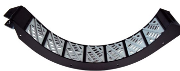
KX7 MaxThresh Extreme Wear Concave Assembly