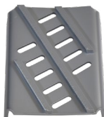
KX7 MaxThresh Small Hole Box Insert