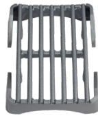
KX7 MaxFlow Box Insert