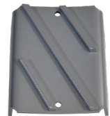
KX7 MaxClosed Box Insert