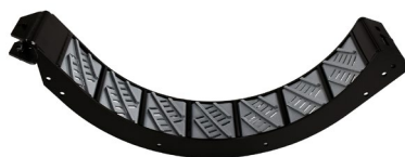
KX7 MaxThresh Small Hole Concave Assembly