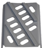
KX7 MaxThresh Box Insert