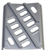
KX7 MaxThresh Extreme Wear Box Insert